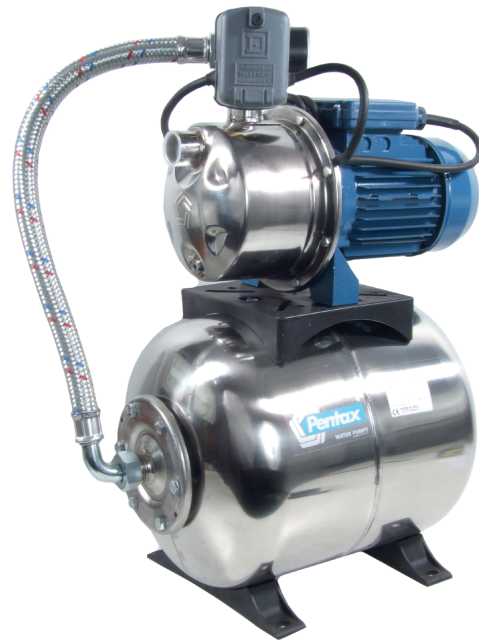
INOX 80 AUTO